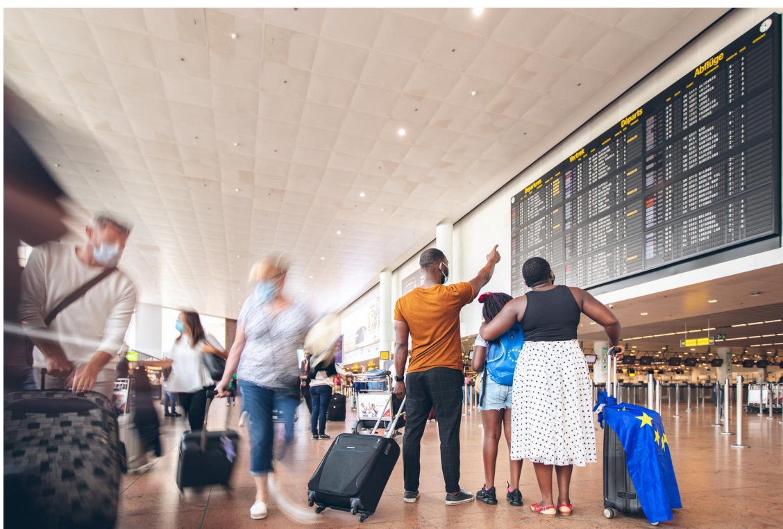
EU Digital COVID Certificate will make travel in the EU easier from 1 July 2021.